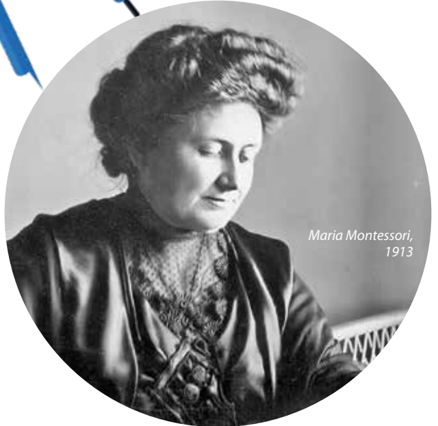
Maria Montessori, 1913

Maria Montessori believed that a teacher’s role was that of a facilitator, someone who guides the children into discoveries and exploration. As a teacher, it’s easy to overexplain, but when I hold back a bit and only help as