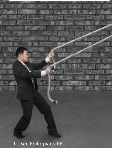
2. Isaiah 30:21 NIV

Trusting in God doesn't guarantee that the changes will be easy to go through, or that the hardship or